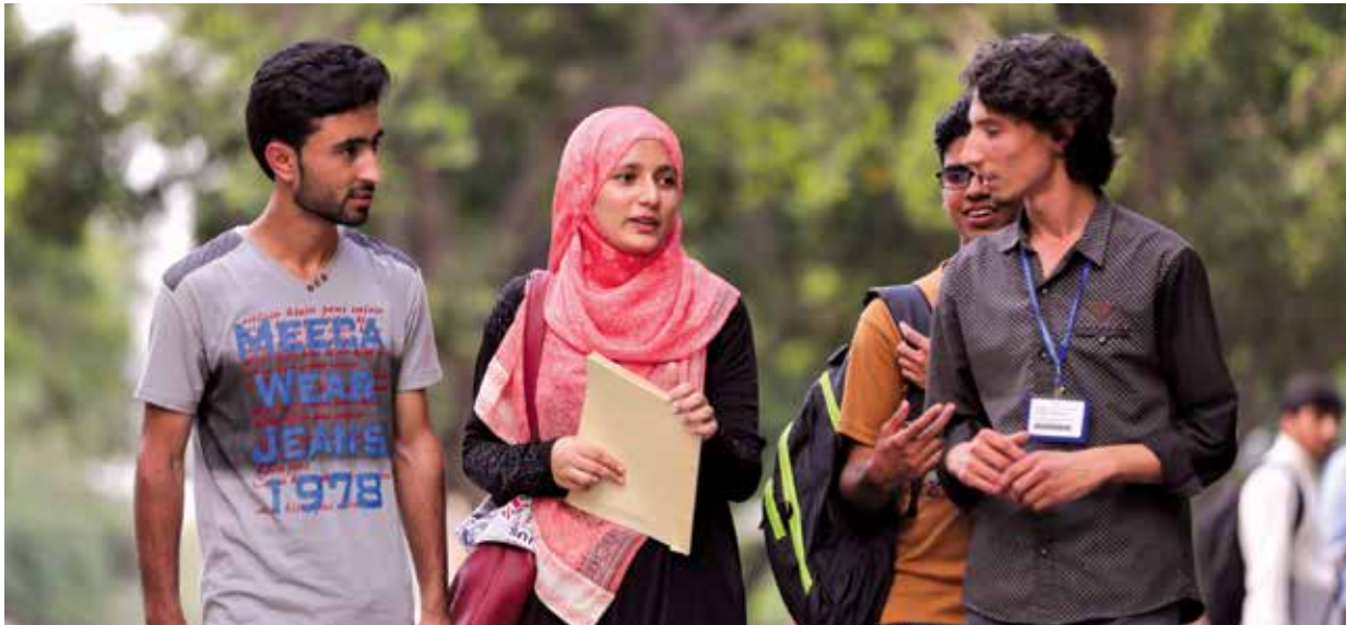
Incoming first-year NOP students are paired with senior NOP students as peer mentors

As LUMS graduates, these NOP scholars are equipped with vital skills and the confidence to thrive in a competitive job market. Utilising their world-class degree, they are quickly able to pursue lucrative careers. The economic impact on the families of these individuals is immeasurable.