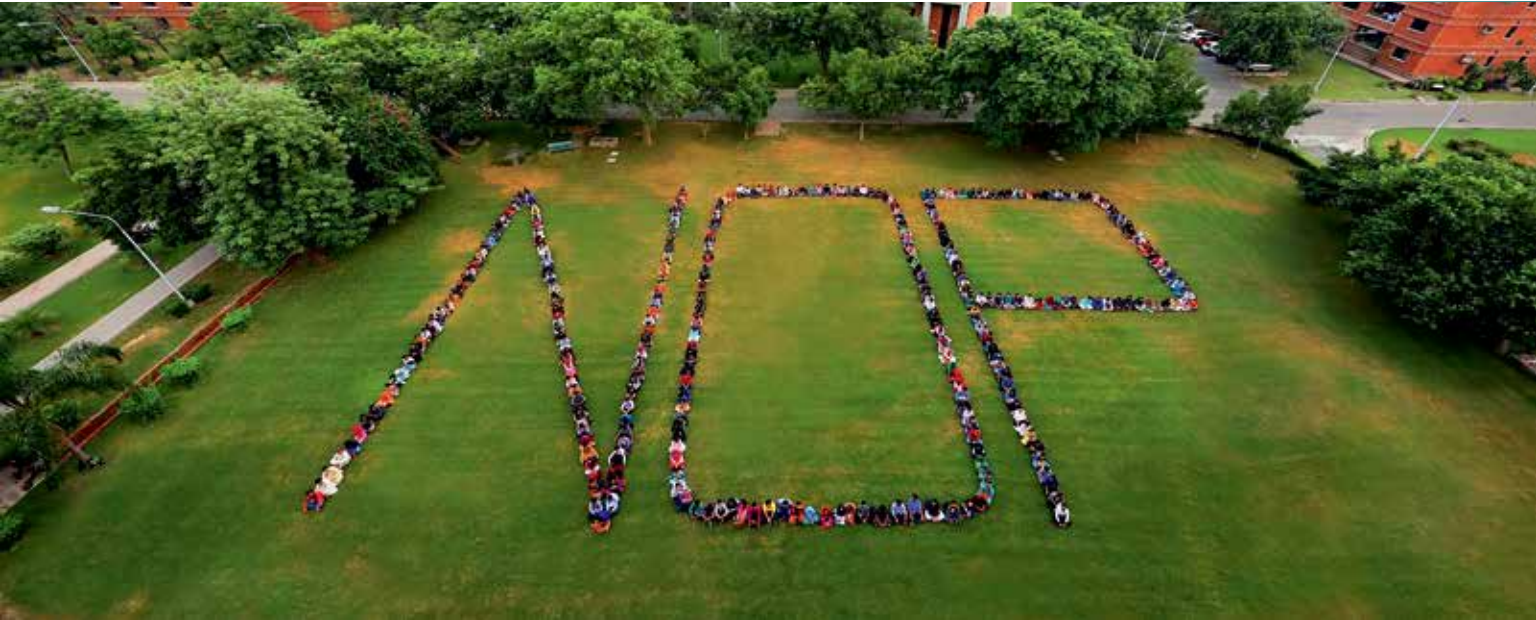
NOP Summer Coaching Session participants gather for a photograph