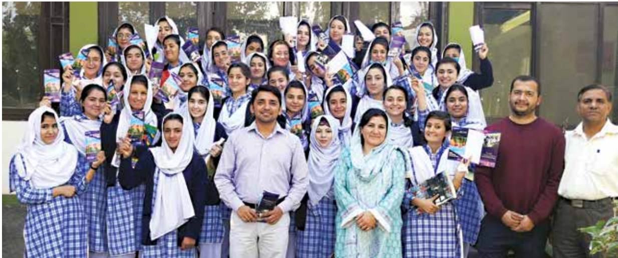
Students from Elysian School and College, Gilgit-Baltistan

Interestingly, a consistent stream of NOP scholars has been coming from the same institutions. This is because once an applicant gets admitted to LUMS through the NOP, they guide their juniors back home on how to apply. The scholars become a source of inspiration for their juniors who feel that pursuing higher education at LUMS is a possibility.