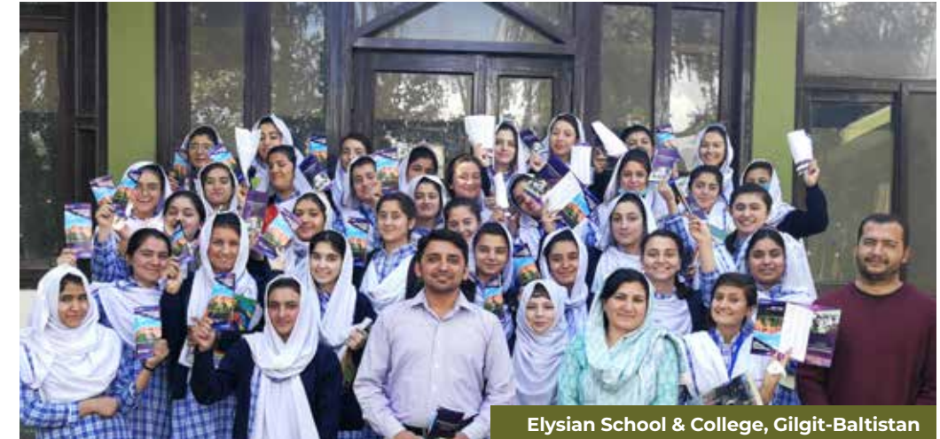
Elysian School & College, Gilgit-Baltistan