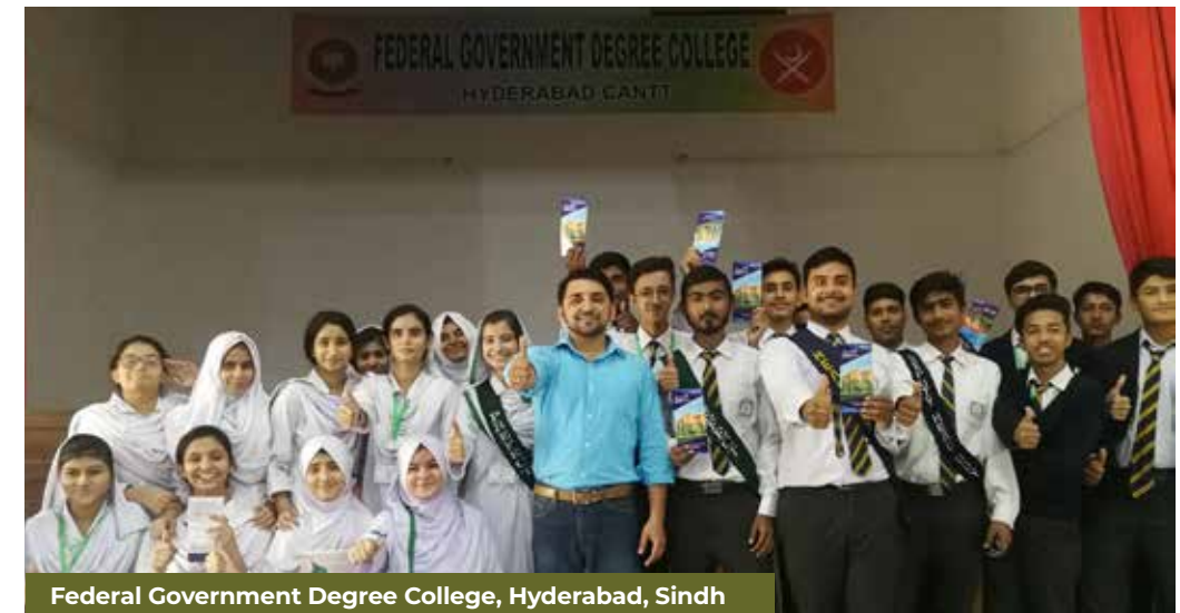
Federal Government Degree College, Hyderabad, Sindh