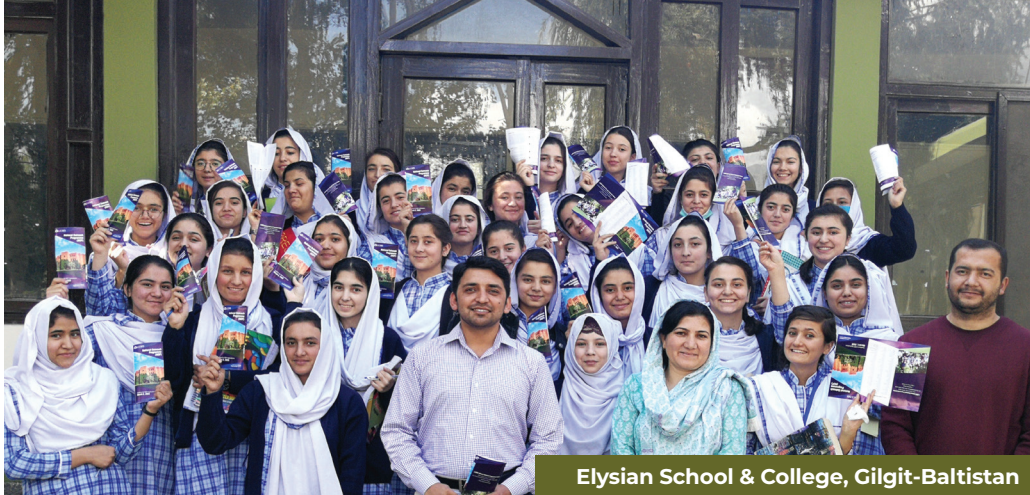
Elysian School & College, Gilgit-Baltistan