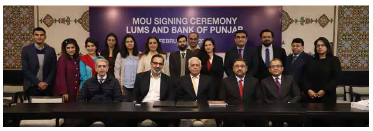
The senior management of the Bank of Punjab with the LUMS leadership at the MoU signing ceremony

According to the agreement signed on February 13, 2020, the Bank of Punjab will finance its employees to complete the LUMS Executive MBA programme and will also send their employees to open enrolment programmes at the Rausing Executive Development Centre (REDC) to enhance their skill set.