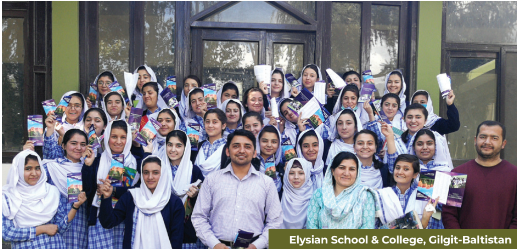
Elysian School & College, Gilgit-Baltistan