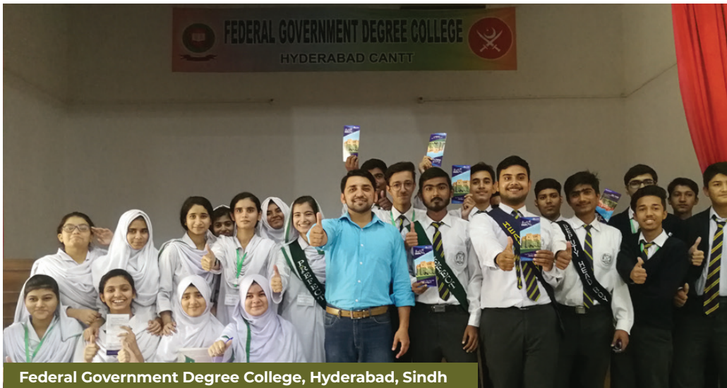
Federal Government Degree College, Hyderabad, Sindh