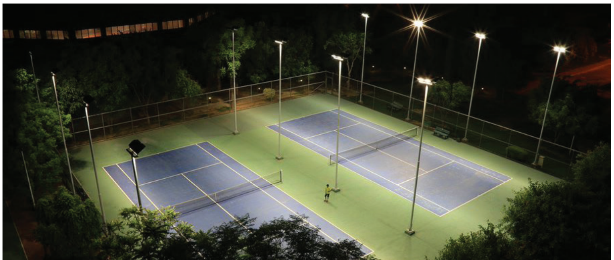
Tennis Courts at LUMS