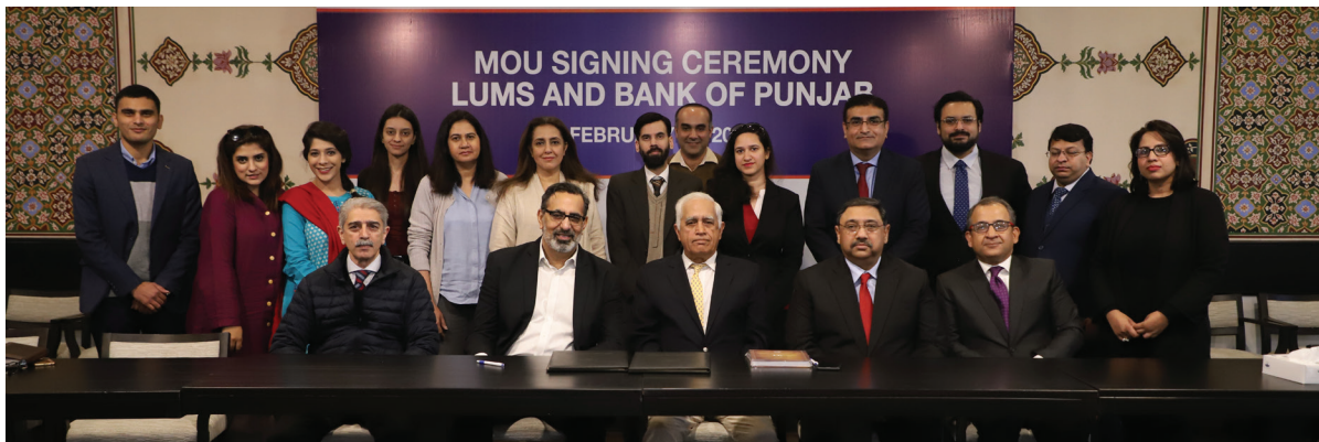
The senior management of the Bank of Punjab with the LUMS leadership at the MoU signing ceremony

According to the agreement signed on February 13, 2020, the Bank of Punjab will finance its employees to complete the LUMS Executive MBA programme and will also send their employees to open enrolment programmes at the Rausing Executive Development Centre (REDC) to enhance their skill set.