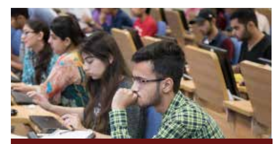
Technology is key in providing our students with a superior educational experience