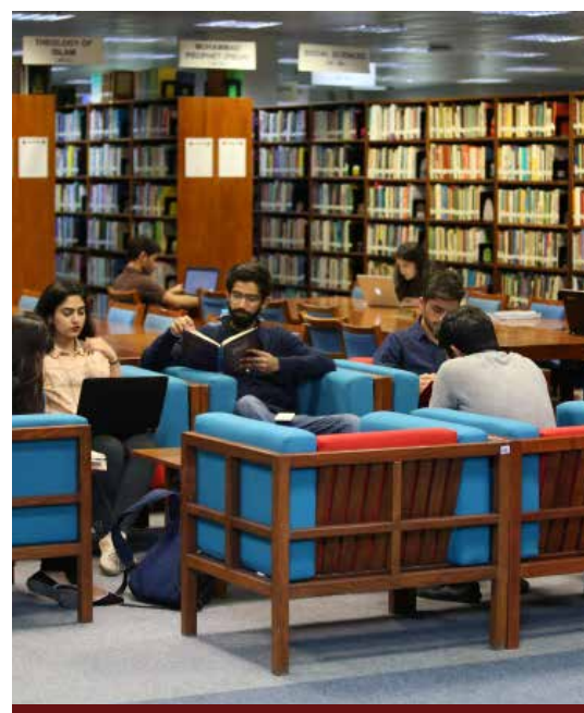
The Gad and Birgit Rausing Library at LUMS has a wide range of collections and online services