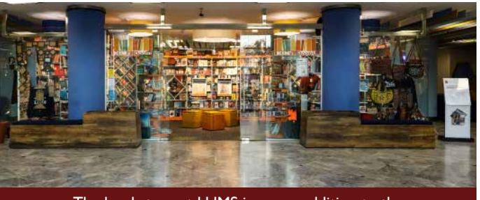
The bookstore at LUMS is a new addition to the campus facilities