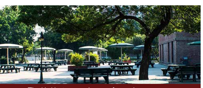
The khokha is a popular spot for students to come together after class