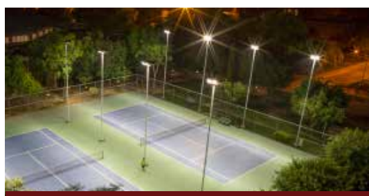
The tennis courts at LUMS are frequented by students, faculty and staff