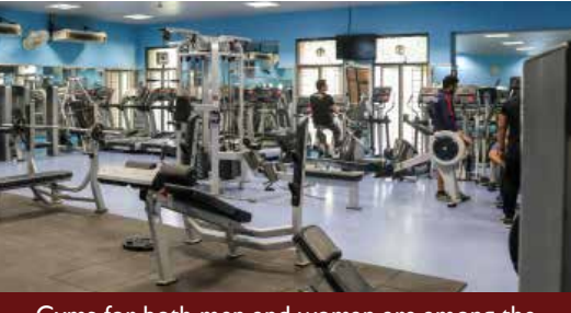
Gyms for both men and woman are among the many facilities at LUMS