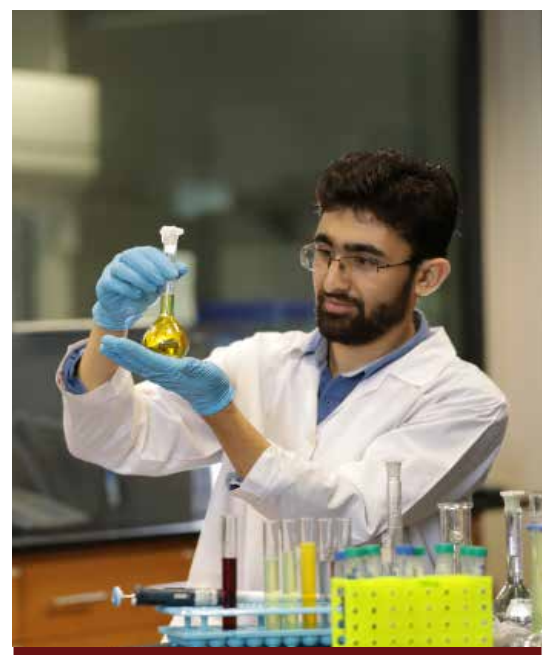
Students conduct cutting-edge research in our state-of-the-art labs