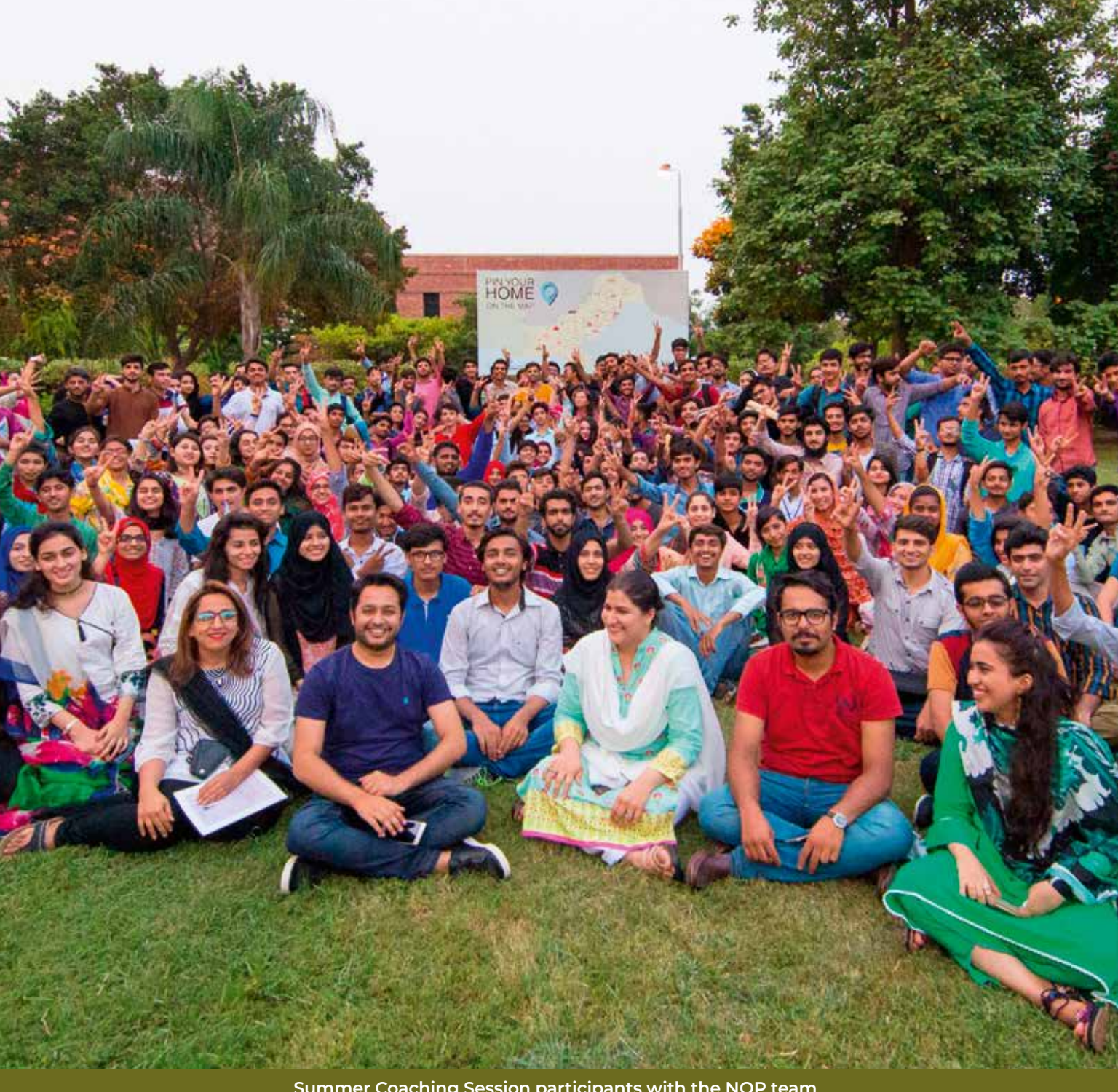
Summer Coaching Session participants with the NOP team