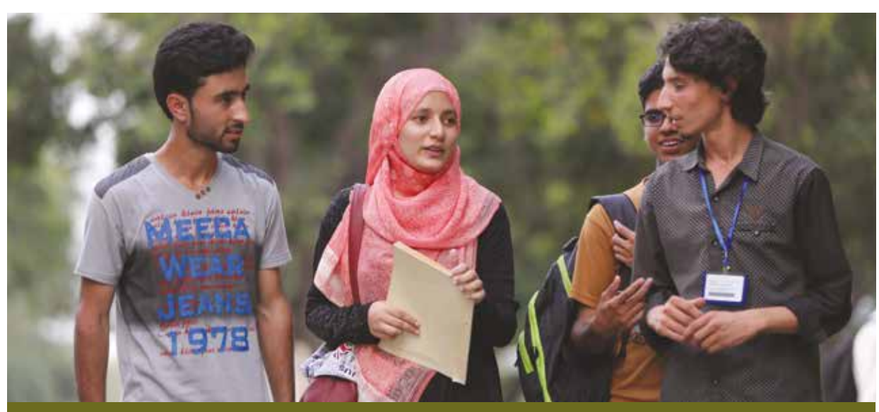
Incoming first-year NOP students are paired with senior NOP students as peer mentors

As LUMS graduates, these NOP scholars are equipped with vital skills and the confidence to thrive in a competitive job market. Utilising their worldclass degree, they are quickly able to pursue lucrative careers. The economic impact on the families of these individuals is immeasurable.