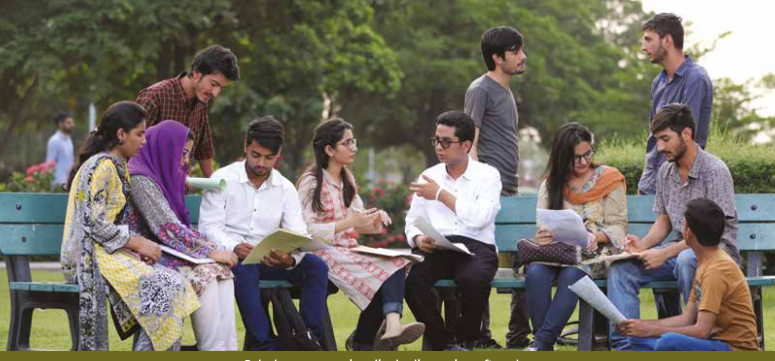
Scholars engage in a lively discussion after class