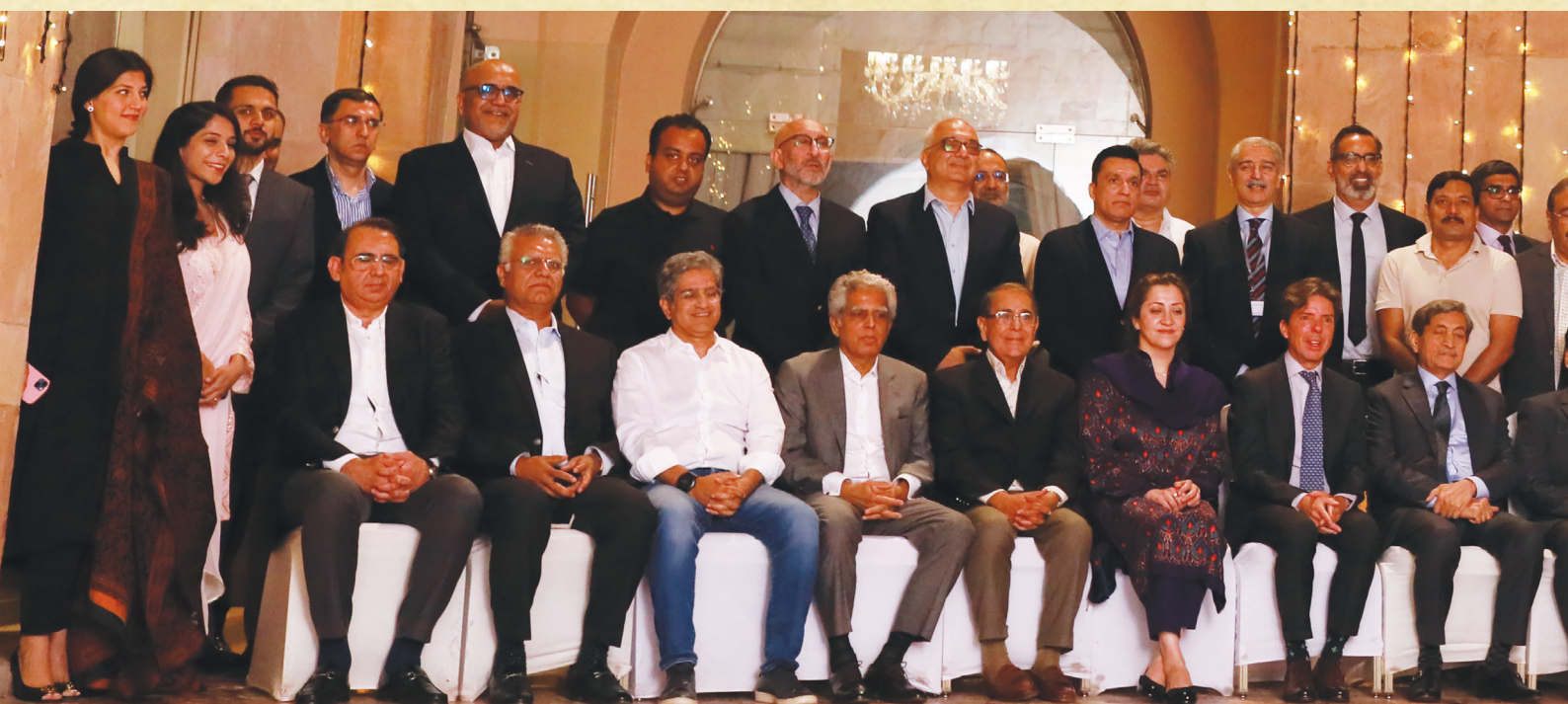
Donor engagement dinner with donors and alumni in Islamabad

Through discussions and presentations, the guests were apprised of the recent achievements of the University and its high-impact initiatives in the areas of innovation, knowledge creation, and community development. The sessions also emphasised that strong industry-academia partnerships and investment in research-based solutions are the only effective ways of tackling local and regional challenges.