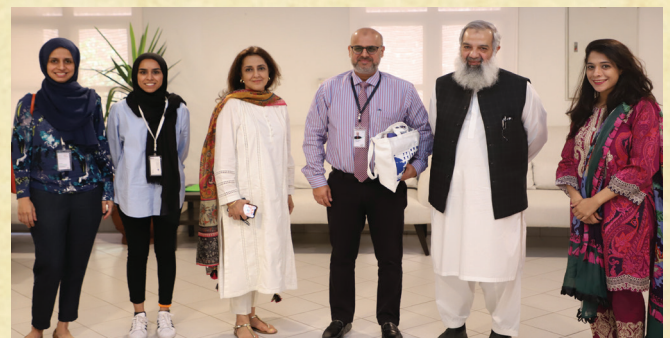
The Orange Tree Foundation team discussed ways to make education accessible to all, an integral mission of LUMS