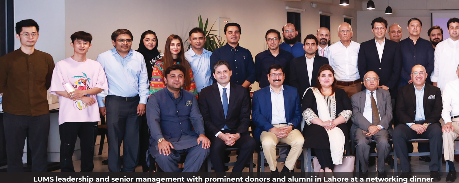
LUMS leadership and senior management with prominent donors and alumni in Lahore at a networking dinner