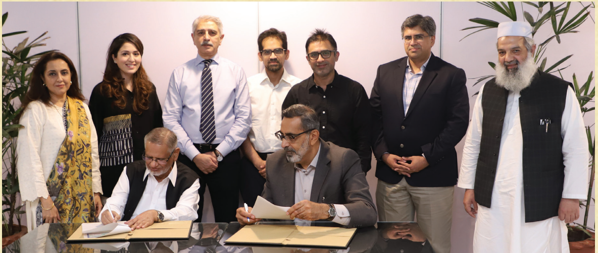
GFC Fans signs an MoU with LUMS to sponsor an NOP scholar