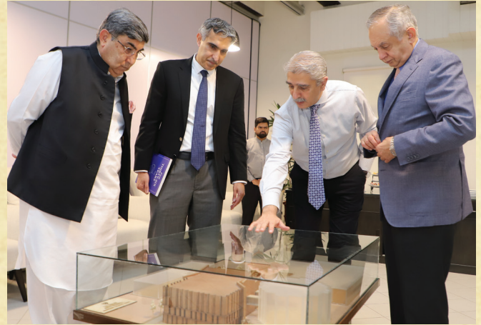
LUMS and the Atlas Group share a long history of association and mutual interests