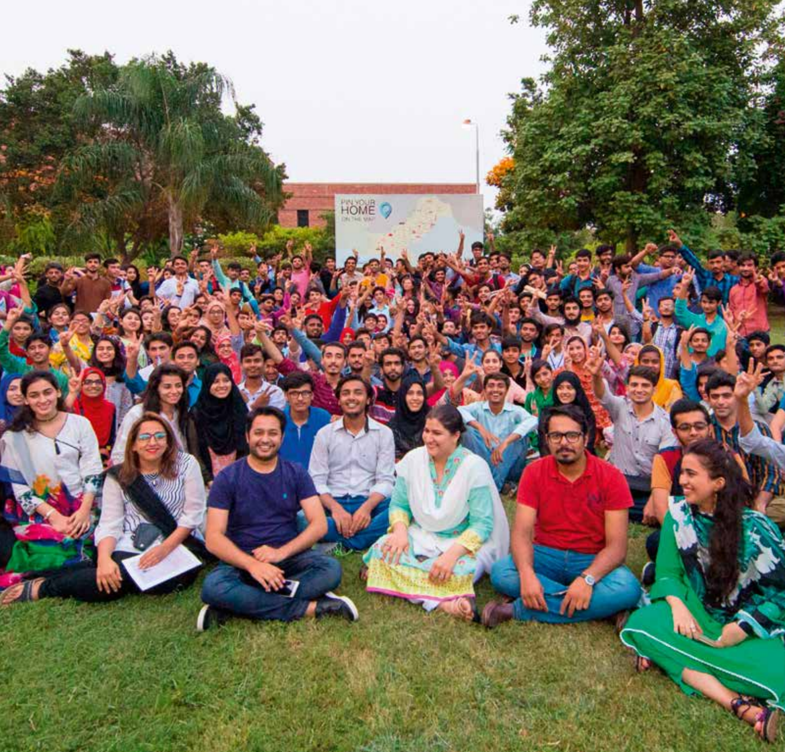
Summer Coaching Session participants with the NOP team