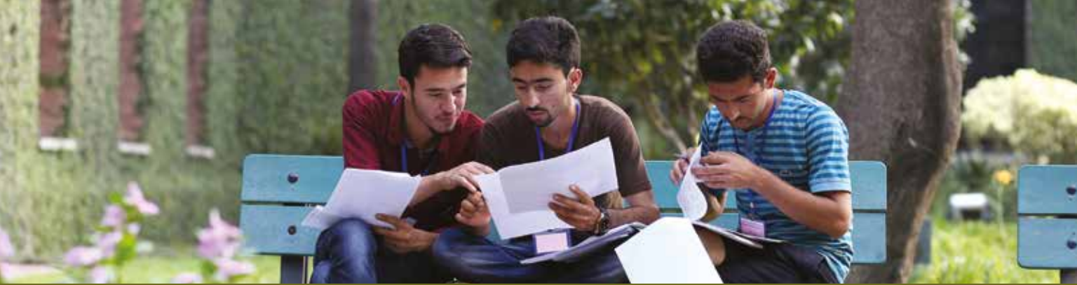
Working in groups helps students learn from each other's perspectives