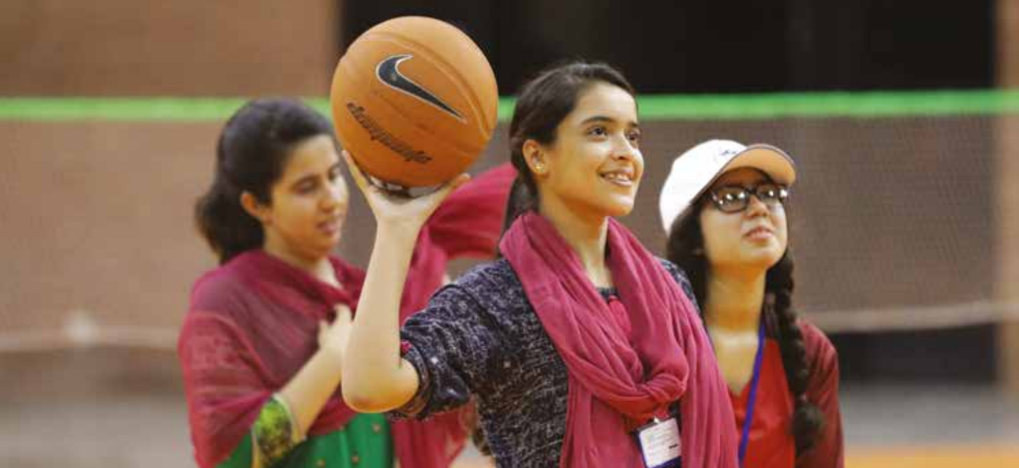
A basketball match in between classes