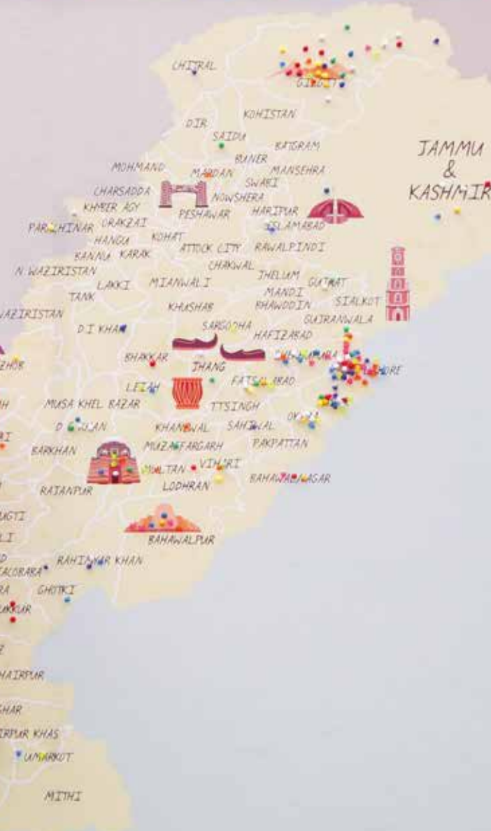
During a session to get to know each other, a student locates her hometown on the map of Pakistan