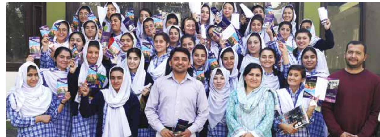
Students from Elysian School and College, Gilgit-Baltistan

stream of NOP scholars has been coming from the same institutions because once an applicant gets admitted to LUMS through the NOP, they guide their juniors on how to apply and get selected. The scholars become a source of inspiration for their juniors who feel that pursuing higher education at a prestigious university such as LUMS is a possibility for them as well.