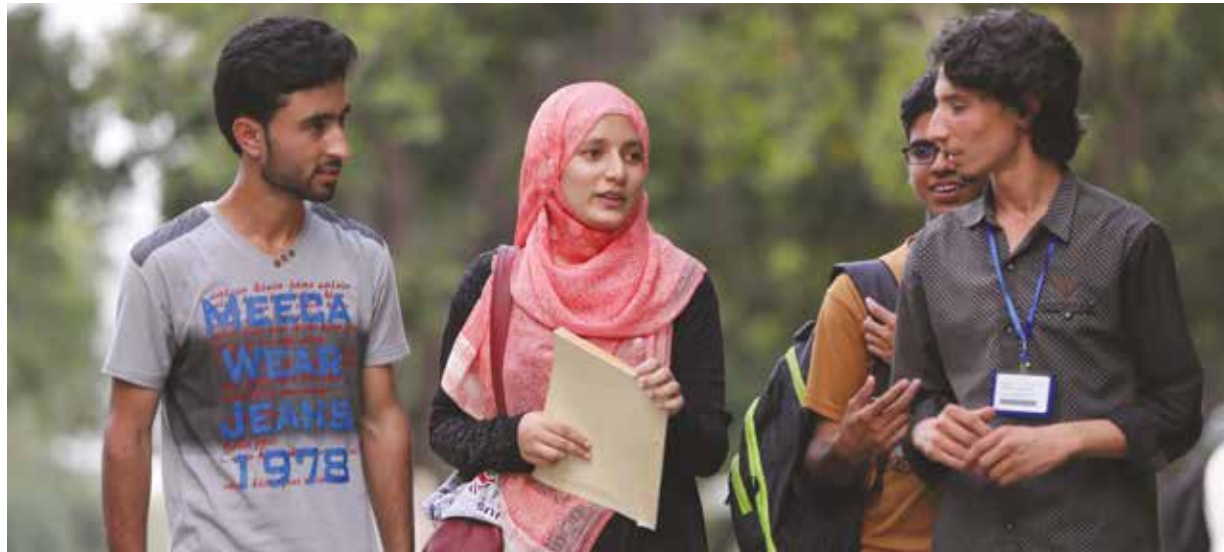
Incoming first-year NOP students are paired with senior NOP students as peer mentors

As LUMS graduates, these NOP scholars are equipped with vital skills and the confidence to thrive in a competitive job market. Utilising their world-class degree, they are quickly able to pursue lucrative careers. The economic impact on the families of these individuals is immeasurable.