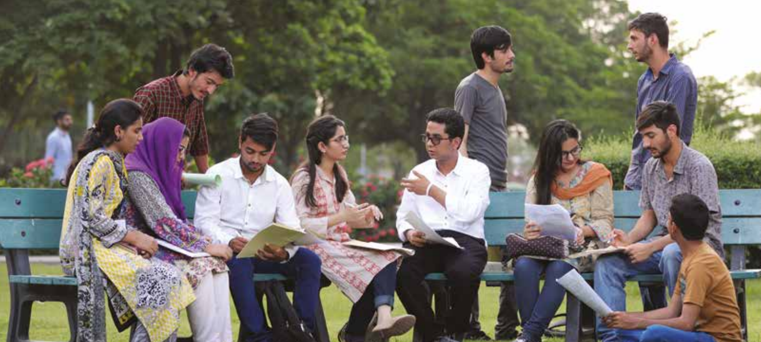
Scholars engage in a lively discussion after class