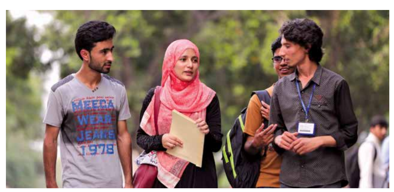
Incoming first-year NOP students are paired with senior NOP students as peer mentors

As LUMS graduates, these NOP scholars are equipped with vital skills and the confidence to thrive in a competitive job market. Utilising their world-class degree, they are quickly able to pursue lucrative careers. The economic impact on the families of these individuals is immeasurable.