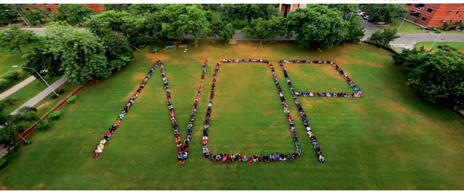
NOP Summer Coaching Session participants gather for a photograph