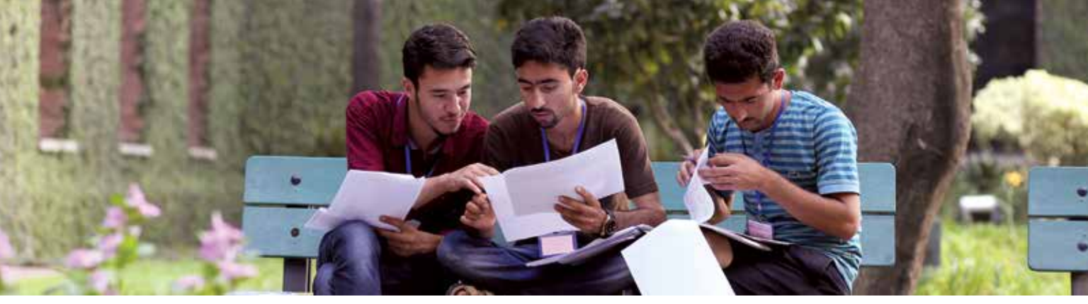
Working in groups helps students learn from each other's perspectives