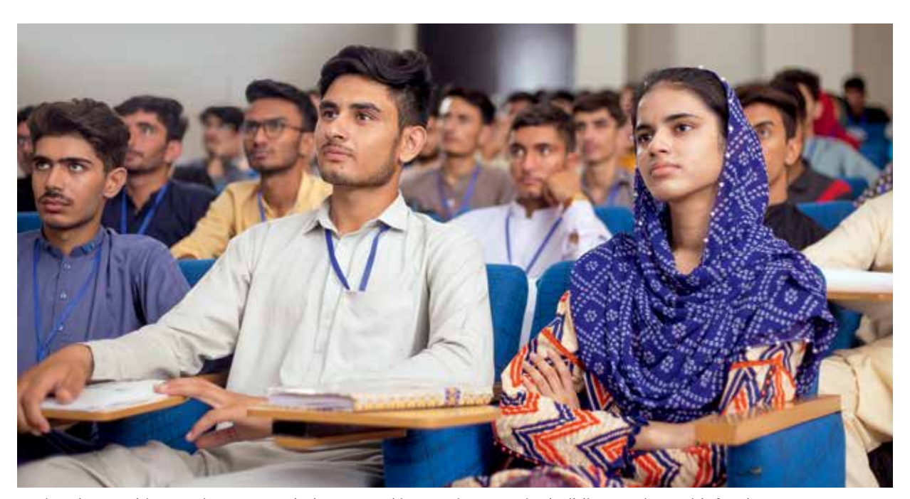
During the coaching sessions, NOP scholars attend interactive capacity-building sessions with faculty members and trainers

Additionally, scholars also have access to a dedicated nonclinical counsellor who offers support to those struggling academically, socially or otherwise.