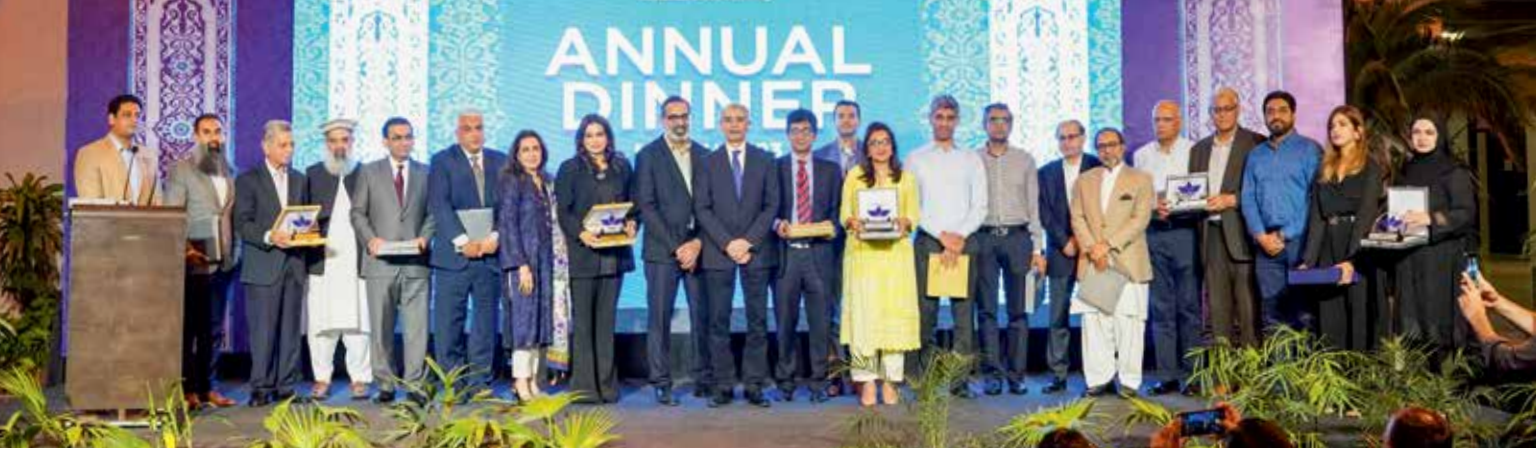
Recognising the unwavering commitment of its esteemed donors, LUMS presented shields of appreciation at the Annual Dinner 2023 held in Lahore