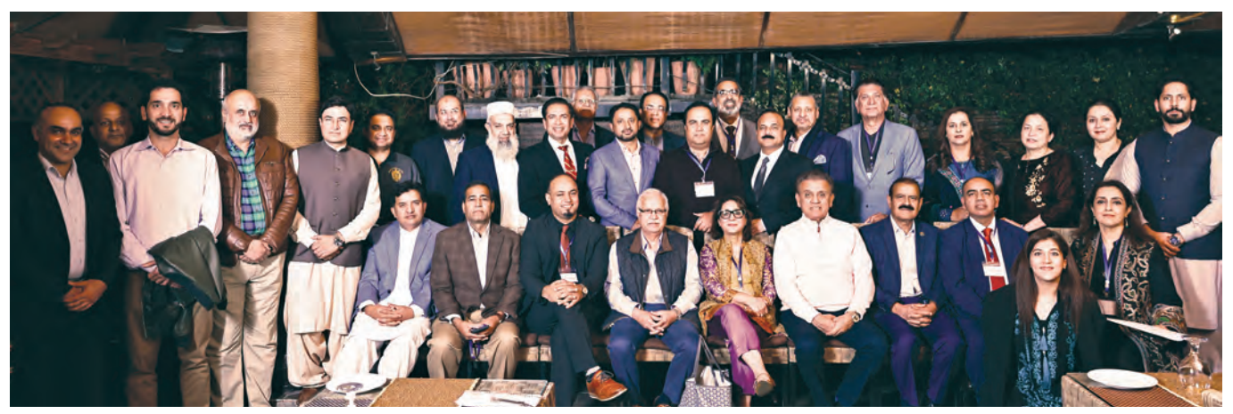
The recipients of the inaugural 'Pride of Pakistan - Medal of Excellence' Awards at a dinner hosted by LUMS in Islamabad

connecting with the University for impactful collaborations in the near future.