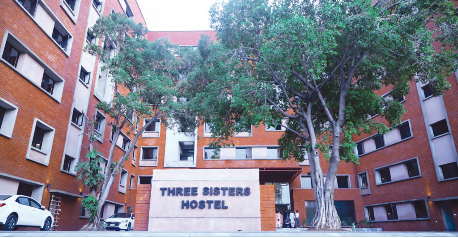
The hostel is able to accommodate over 500 female students on campus