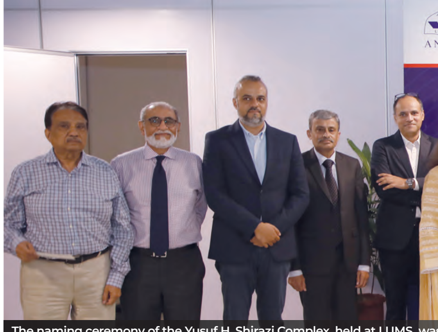
The naming ceremony of the Yusuf H. Shirazi Complex, held at LUMS, was