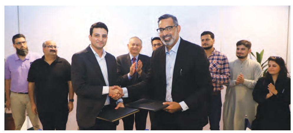
The MBA Class of 2022 is the youngest batch to have donated to their alma mater

To commemorate the gift, an event was held at LUMS on September 1, 2022, attended by representatives of the MBA Class of 2022, as well as other students who joined the event virtually.